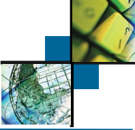
Image and Imagination: Small-Group Peer Response and the Role of the Group Facilitator as “Meta-Tutor”