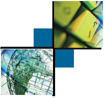
Image and Imagination: Small-Group Peer Response and the Role of the Group Facilitator as “Meta-Tutor”