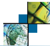
Image and Imagination: Small-Group Peer Response and the Role of the Group Facilitator as “Meta-Tutor”